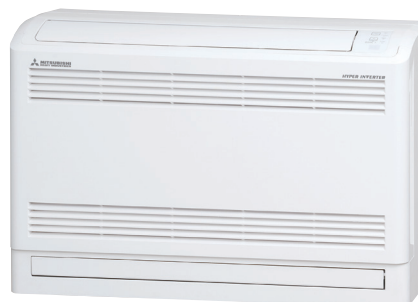
SRF25ZS-W, SRF35ZS-W, SRF50ZSX-W