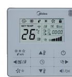
Optional Wired Controller